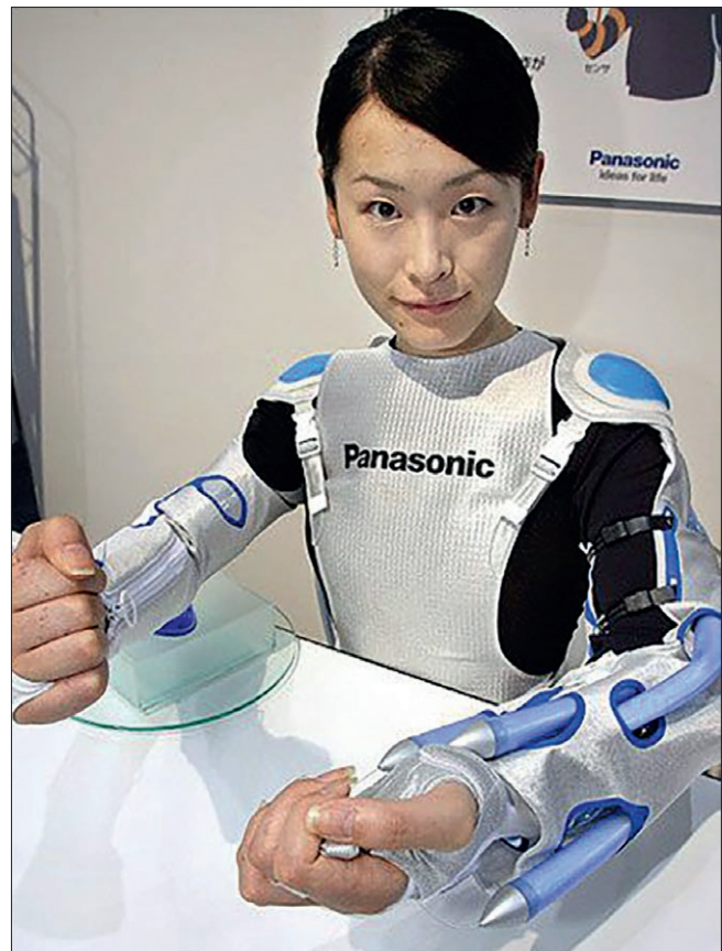
Fig. 1. Exoskeleton suit

Positive results of the rehabilitation of patients with the consequences of spinal cord injury were got through a mix of the exoskeleton using with the functional electrical stimulation of the lower limbs. When compared with the control group that received the traditional rehabilitation complex, the electromyography parameters of the back muscles and