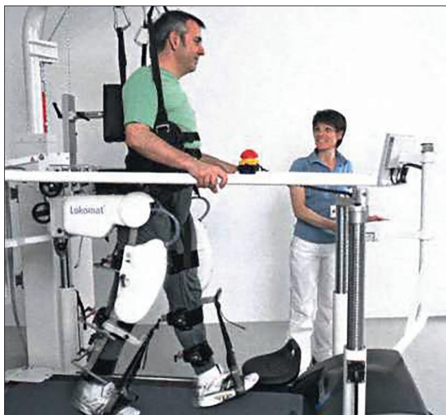
Fig. 2. The «Lokomat Pro» technological complex

the quality of daily life and also the motor activity of the upper limbs [17]. Rehabilitation-oriented repetitive movement exercises, balance training, and the using of a robotic running track can improve muscle strength and motor coordination in among neurological patients with movement disorders [18, 19].